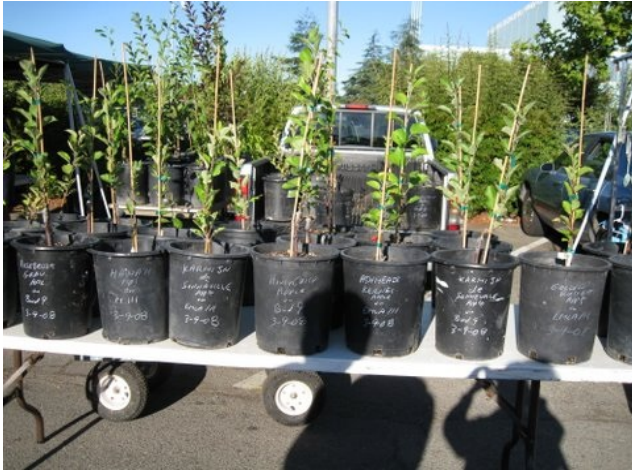
Plants for sale

CRFG members who volunteered to work at the sale brought fruit for tasting, and at the table we set out samples of babaco, Catharine Bunnell plums, Saturn peaches, and Geo Pride pluots. For sale we had a lot of Fort Ross Gravenstein trees and a large variety of others, most donated by chapter members: apple, pear, and plum trees; exotics, including babaco, banana, cherimoya, white sapote, and Budda's hand; and pots of raspberries, peppers, artichokes, and other plants, edible and ornamental.